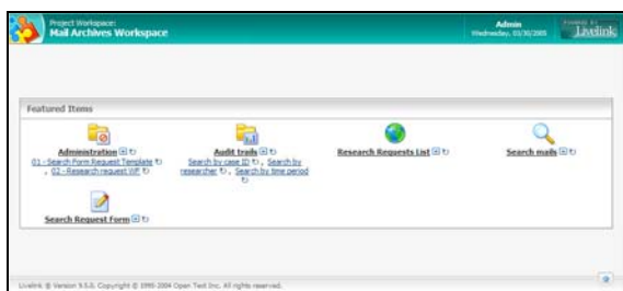
A designated review workspace provides search functionality across all captured email content.

A designated review workspace provides administrators, reviewers, and auditors with search functionality across all journaled email content. And not only must organizations be concerned with the email communications that are sent and received within their firms, but they must also be aware of who has access to this archived content. A robust permissions-based security model ensures that only the appropriate users have access to journaled email content. And comprehensive audit trails keep track of who has searched for and viewed what email content, and when.